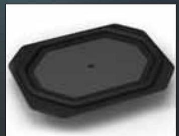
QUADRATIC PLANAR INFRASONIC RADIATOR