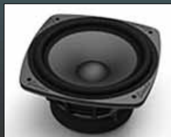
5.25" HIGH-DEFINITION BASS/MIDRANGE DRIVER (XXL)